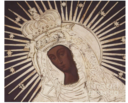
Month of Mary, Mother of God

Listen to Sacred Heart Radio: Sacred Heart Radio brings you the most sought-after Catholic speakers and authors at any time: on the radio at 740 AM and 910 AM, or online at www.sacredheartradio.com . Listen live or scan our QR code for the free app to hear Sacred Heart Radio on your phone from anywhere.